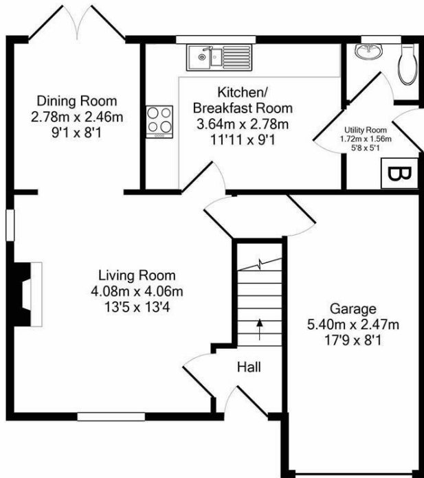
GROUND FLOOR APPROX. FLOOR AREA 53.5 SQ.M. (576 SQ.FT.)